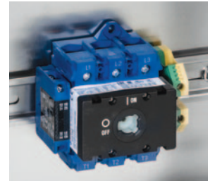
DIN rail mounted switch with auxiliary contacts