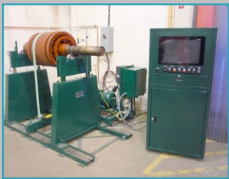
Balancing up to 22,500 lbs.