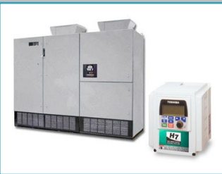
Variable Frequency Drives (VFD)