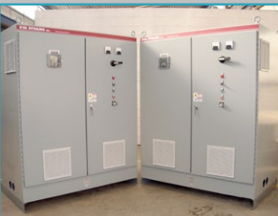
Custom Control Panels