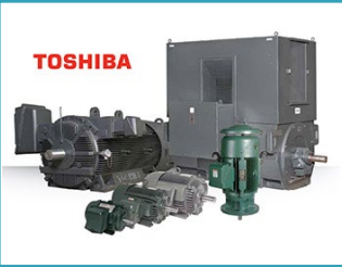
NEMA and Above NEMA motors