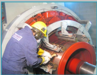
Dedicated Field Service Technicians