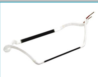
Hydro Generator Stator Coils